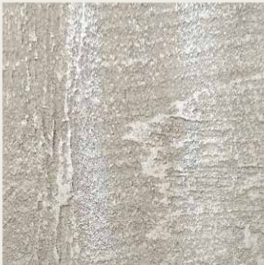
CONCRETE by Novacolor BIANCO & FS 6101 & RUSTON METAL SILVER