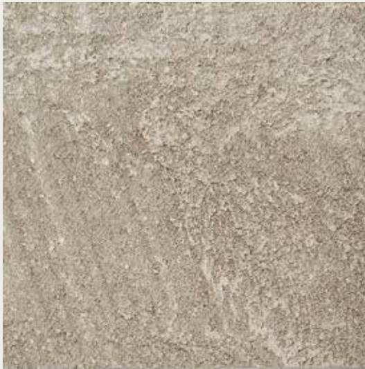
CONCRETE by Novacolor 4654 PC 2010 & FS 6101 & FS 6110