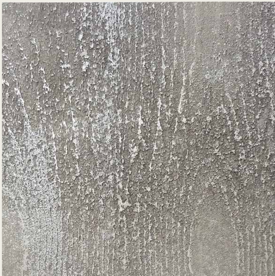
CONCRETE by Novacolor 4654 PC2010 & FASE SILOSSANICA FS 6101 & RUSTON METAL SILVER

Ergiebigkeit: 1,6-2 Kg/m 2 in zwei Schichten. Für weitere Infos bitte siehe Technisches Merkblatt.