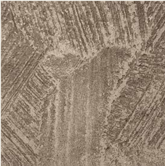
CONCRETE by Novacolor 17007 & FS 6112